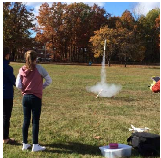
5 th Graders Launching Rockets with Star Base!