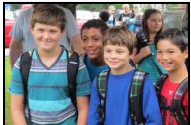
C.P. Smith students on the first day of school.